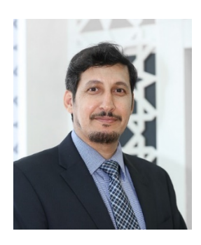
Hamoud Otaibi Saudi Arabia

This section covers the Ministry's policies on climate change and other emissions to air, including national policies and international cooperation on issues, related to energy and climate change. This includes Norway's Clean Energy Ministerial membership. Stig is presently one of four co-chairs of the CEM CCUS Initiative and is a member of the Advisory Board of the CEM Hydrogen Initiative.