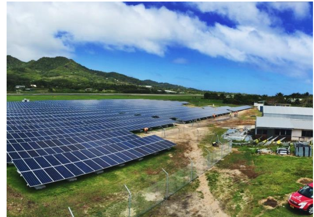
960kW Rarotonga Airport Solar Farm